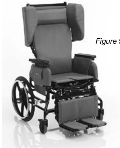
Figure 9. Specialized chairs for HD

wheelchairs (either self-propelling or transit) can be modified with a small wedge cushion or lumbar roll to promote better sitting posture, and padding for armrests and footrests to prevent bruising. Reclining wheelchairs provide the option to change positions from upright, but may encourage a person to slide down in the chair. Specialized seating including side supports and tilt-in-space seating may be necessary to improve upright posture of the trunk and prevent sliding out of the chair. For persons who do not tolerate this type of seating it may be necessary to add padding or use specialized chairs such as the Broda Chair® or the CareFoam™ chair (Figure 9). The CareFoam™ chair and others like it are particularly helpful with persons who tend to turn sideways in their chair and are best used in the later stages of the disease when self-propulsion is no longer possible.