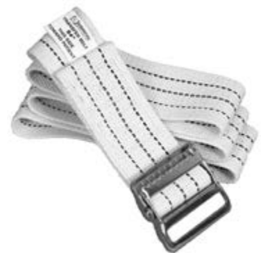
Fig. 1: Standard gait belt that can be purchased for as little as $8.

When helping the person with late stage HD to transfer it is important for caregivers to use good body mechanics to prevent injury to themselves as well as the person with HD. Caregivers should place a gait belt around the waist of the person with HD (Fig. 1) and position themselves so that they are facing the person without any twisting or turning of their backs and with their feet spaced shoulder width apart. Caregivers may also place one foot in front of the other to make it easier to move forward and backward during transfers. Bending at the knees and grasping the gait belt, caregivers should ask the person with HD to help them and after a count of 3 to assist the person to stand up from the chair/bed/toilet or to sit down on the chair/bed/toilet. When a person with HD is no longer able to stand for transfers, a sliding board or transfer lift such as a Hoyer lift may be needed to safely transfer the person. Physical therapists can train caregivers on how to utilize these devices.