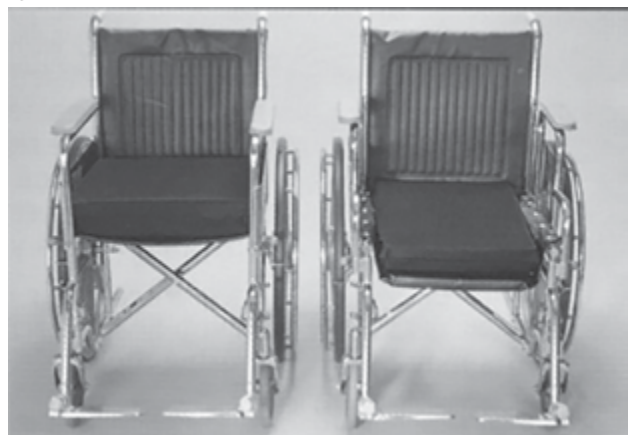
Fig 8 Standard height wheelchair and drop seat or hemi-height wheelchair

When a person is no longer able to walk independently, they can often maintain their mobility by learning to self-propel using their legs while seated in a hemi-height or drop seat wheelchair (Fig 8). Standard