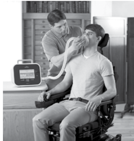
Fig. 7: Cough Assist or Mechanical insufflator - exsufflator.