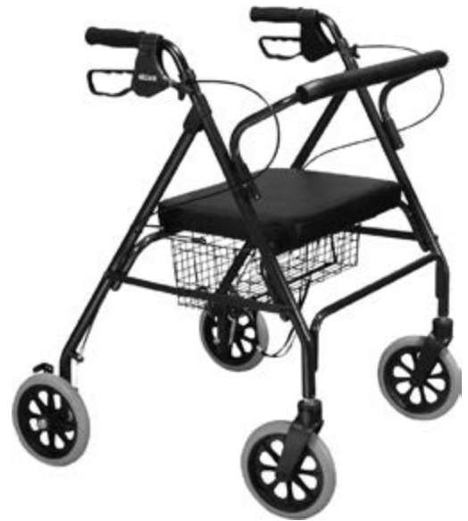
Fig. 3: Rollator Walker

The gait belt is placed on the person with HD at waist level and fastened snugly. This provides a safe and comfortable place for the caregiver to hold on. It is also easier to catch a person who is falling and possibly prevent a fall when using a gait belt. Avoid holding the person by the arm or under the arm as this can lead to shoulder injuries. Walking 3 times per day until mildly tired is an appropriate quantity to prevent further decline in health and function.