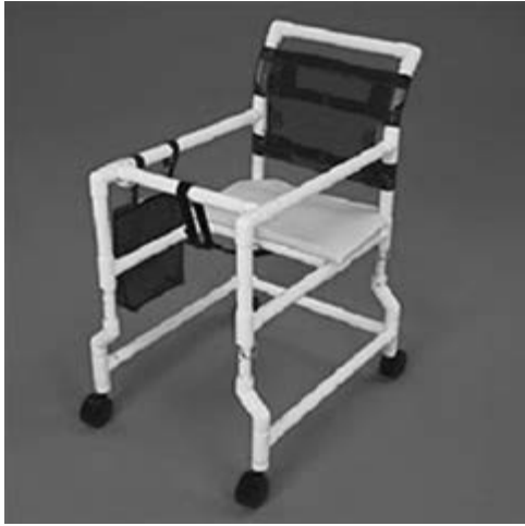
Fig. 4: PVC ambulatory walker