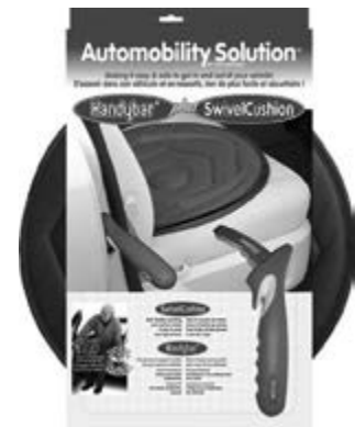
Fig. 2 Swivel cushion and handy bar for car transfers.

When assisting a person with HD to get in and out of a car it may be helpful to place a piece of cloth on the car seat so that the person can slide more easily on the seat. A swivel cushion® may also be purchased (Fig. 2). If the person with HD is in a wheelchair, park the wheelchair as close as possible to the car. Open the car door as wide as it will go. Make sure the wheelchair brakes are on and the footplates have been removed or folded back. There should be enough room beside the car door so that the caregiver and person with HD can both move easily. Move the car seat back to give more room for the legs if needed. Ask the person with HD to slowly stand then step around so his back is towards the car. He should hold on to the car in the most secure but comfortable place. This may be the doorframe, the edge of the car seat or the edge of the dashboard. Support the person's body by using the gait belt as he starts to bend to sit down. To protect the person's head from bumping on the doorframe, place a hand gently over the person's head as he sits down. Ask the person to scoot back into the seat then help him to lift his legs over the doorsill. This method is much safer than if the person with HD tries to step into the car while balancing on one leg.