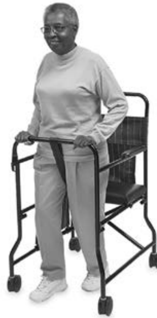
Fig. 5: Merry Walker®